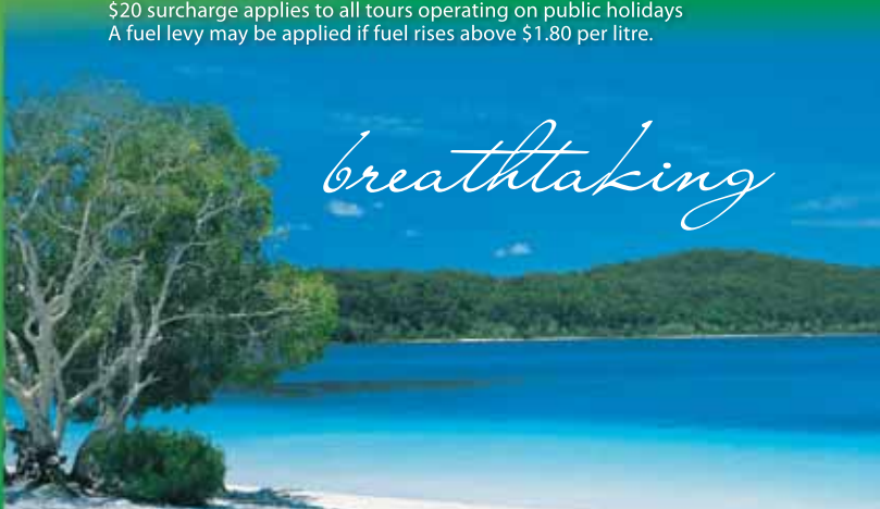
Lake Birrabeen Fraser Island